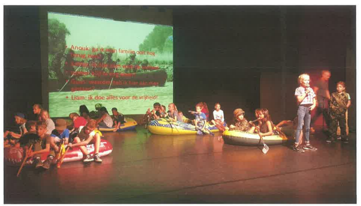
Children from "The Crossing Middle School" presenting a small play and poems of "The Crossing" in memory of the 504<sup>th</sup> PIR, 82<sup>nd</sup> ABN DIV paratroopers who lost their lives crossing the Waal River during Operation Market Garden.