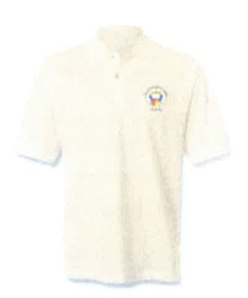
MOISUTURE WICK - LS - SS POLOS * SEE WEBSITE FOR AVAILABLE COLORS