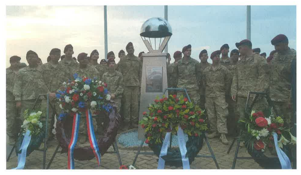
1^{\text{st}} BCT, 504^{\text{th}} PIR, 82^{\text{nd}} ABN DIV paratroopers at the John Thompson Bridge Memorial in Grave the 17tn of September 2016.